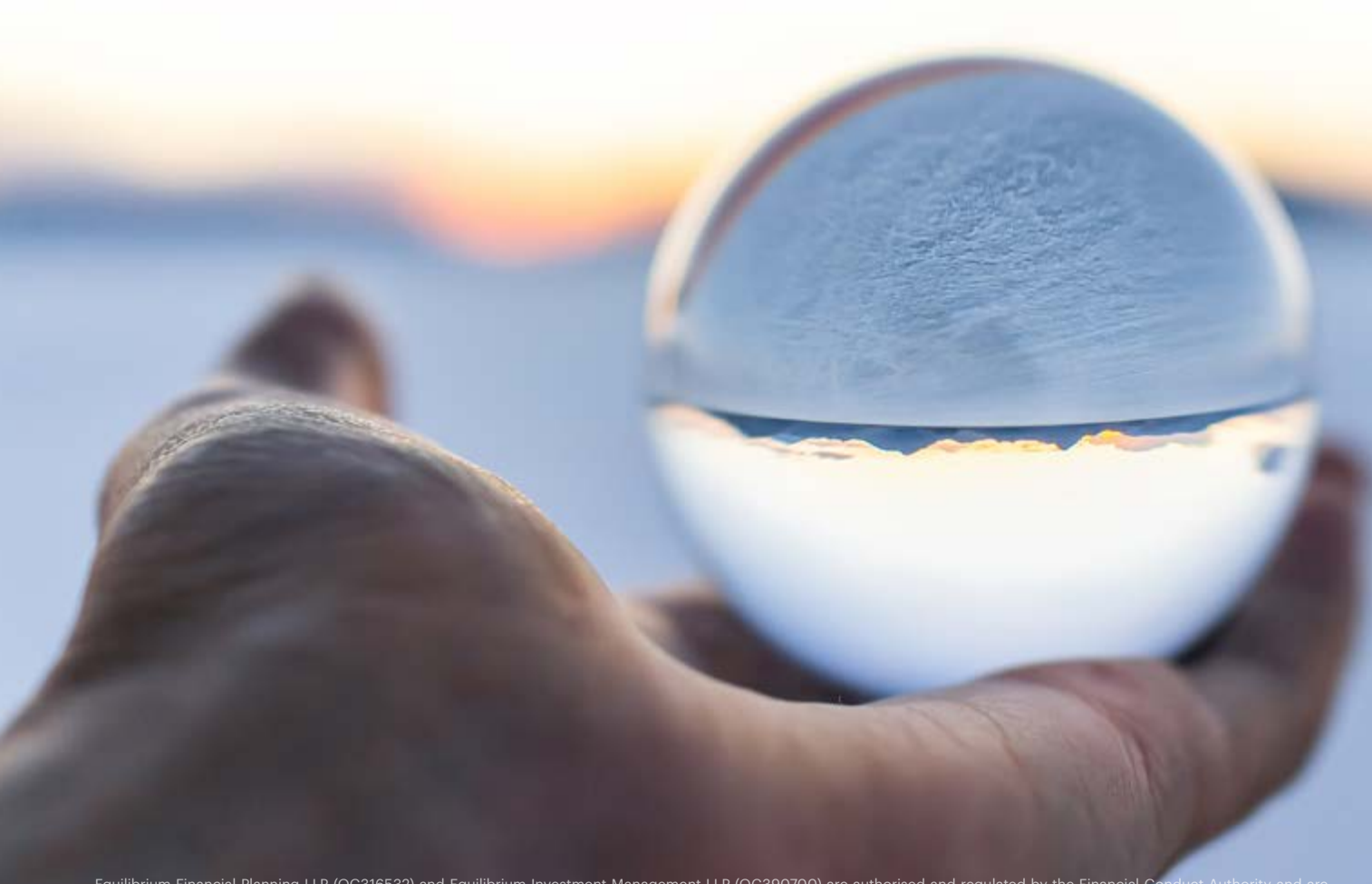
Equilibrium Financial Planning LLP (OC316532) and Equilibrium Investment Management LLP (OC390700) are authorised and regulated by the Financial Conduct Authority and at entered on the financial services register under references 452261 and 776977 respectively. Registered Offices: Ascot House, Epsom Avenue, Handforth, Wilmslow, Cheshire SK9 3D Both companies are registered in England and Wales.

I have no idea which direction the market will go tomorrow, over the next week or even the next few months. However, there are reasons to believe that the long-term returns can be very positive.